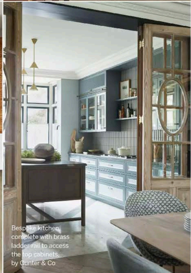
Bespoke kitchen complete with brass ladder rail to access the top cabinets, by Gunter & Co