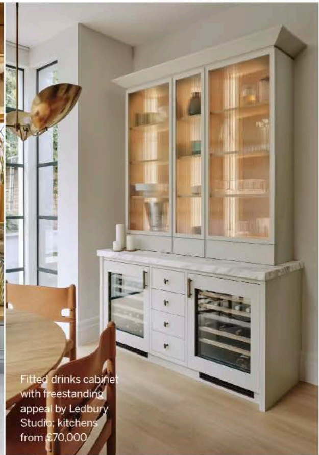
Fitted drinks cabinet with freestanding appeal by Ledbury Studio; kitchens from £70,000