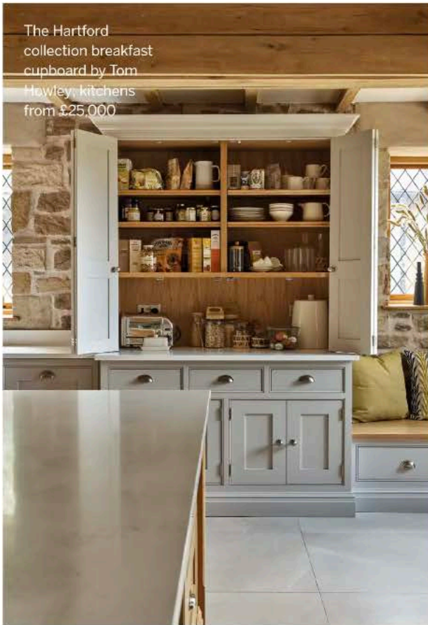
The Hartford collection breakfast cupboard by Tom Howley; kitchens from £25,000