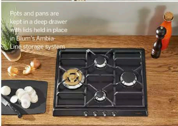
Pots and pans are kept in a deep drawer with lids held in place in Blum's Ambia-Line storage system