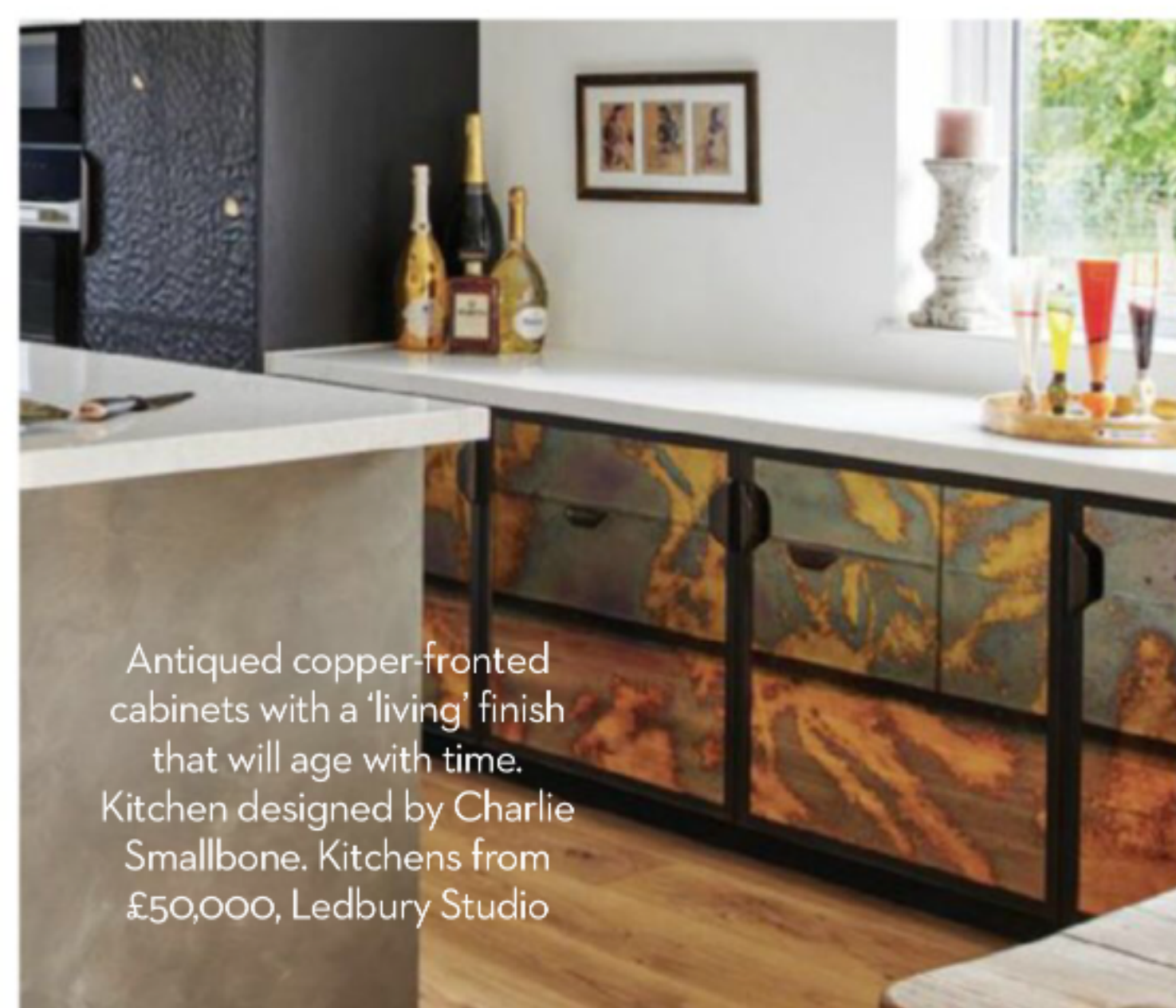
Antiqued copper-fronted cabinets with a 'living' finish that will age with time. Kitchen designed by Charlie Smallbone. Kitchens from £50,000, Ledbury Studio