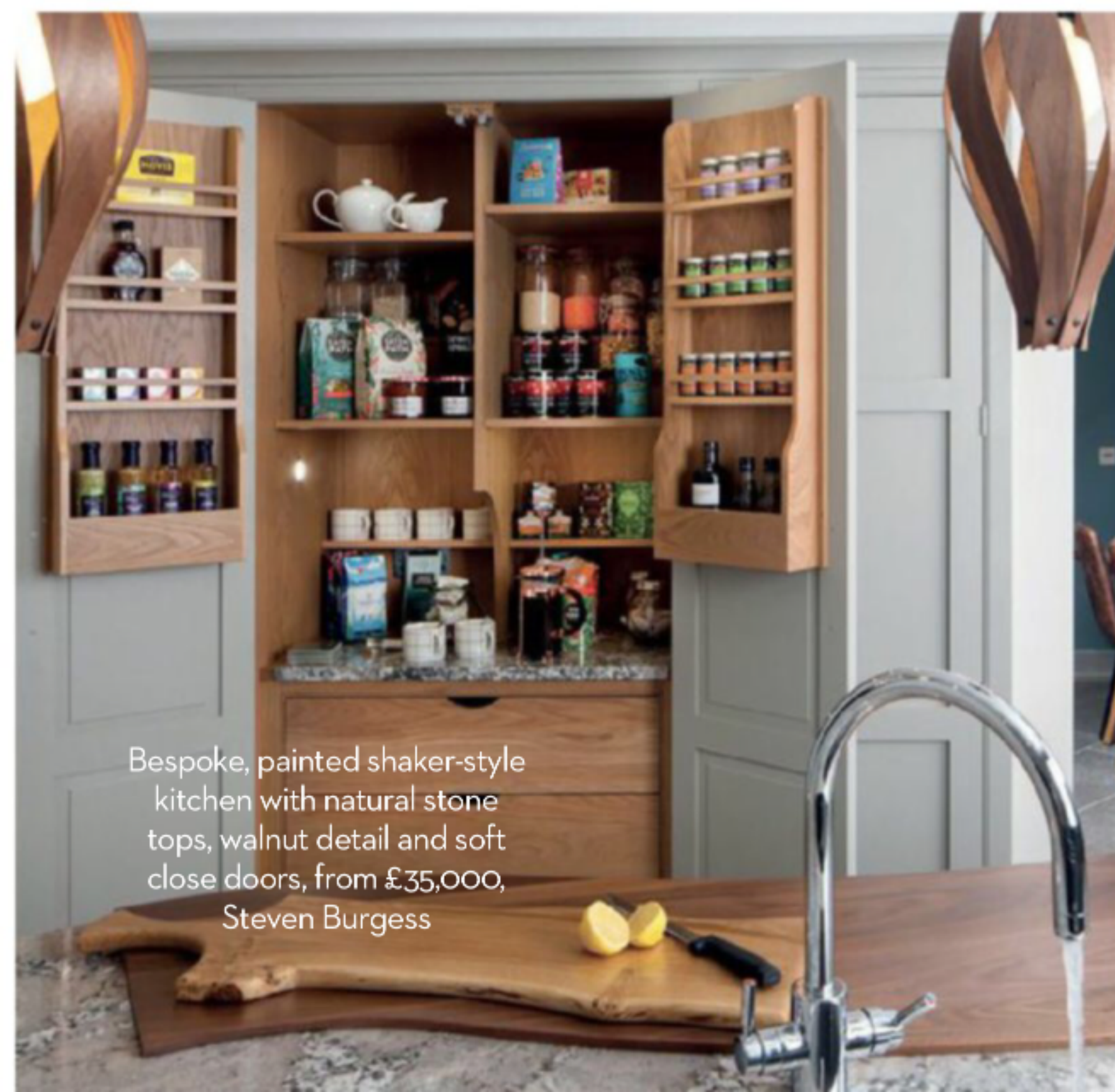
Bespoke, painted shaker-style kitchen with natural stone tops, walnut detail and soft close doors, from £35,000, Steven Burgess