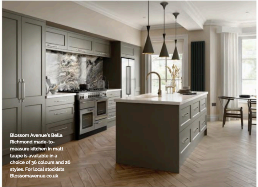
Blossom Avenue's Bella Richmond made-to-measure kitchen in matt taupe is available in a choice of 36 colours and 26 styles. For local stockists Blossomavenue.co.uk

5 TOP TECH: "Sous vide drawers, smartphone connected appliances, wireless worktops for phone charging and under counter wine chillers are all the new luxury kitchen must-haves."