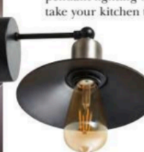
Habitat Pixie wall light, €24, Argos.ie

OFF THE WALL DECORATIVE WALL LIGHTS ARE HAVING A MOMENT AS A MUST-HAVE IN THE KITCHEN