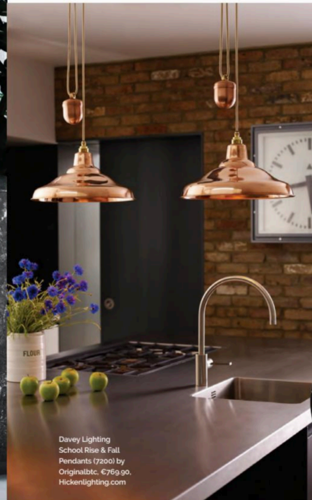
Davey Lighting School Rise & Fall Pendants (7200) by Originalbtc, €769.90, Hickenlighting.com