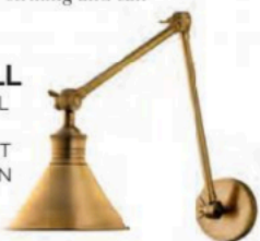
Pooky Stork wall light in antique brass, from €190, Pooky.com