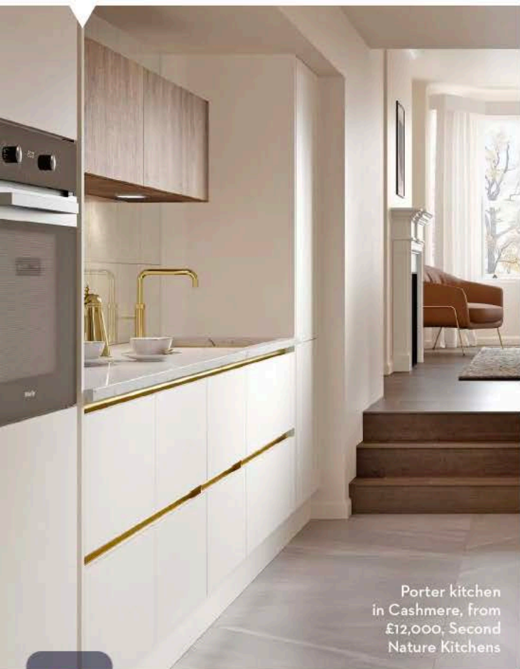
Porter kitchen in Cashmere, from £12,000, Second Nature Kitchens