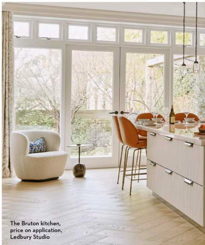
The Bruton kitchen, price on application, Ledbury Studio