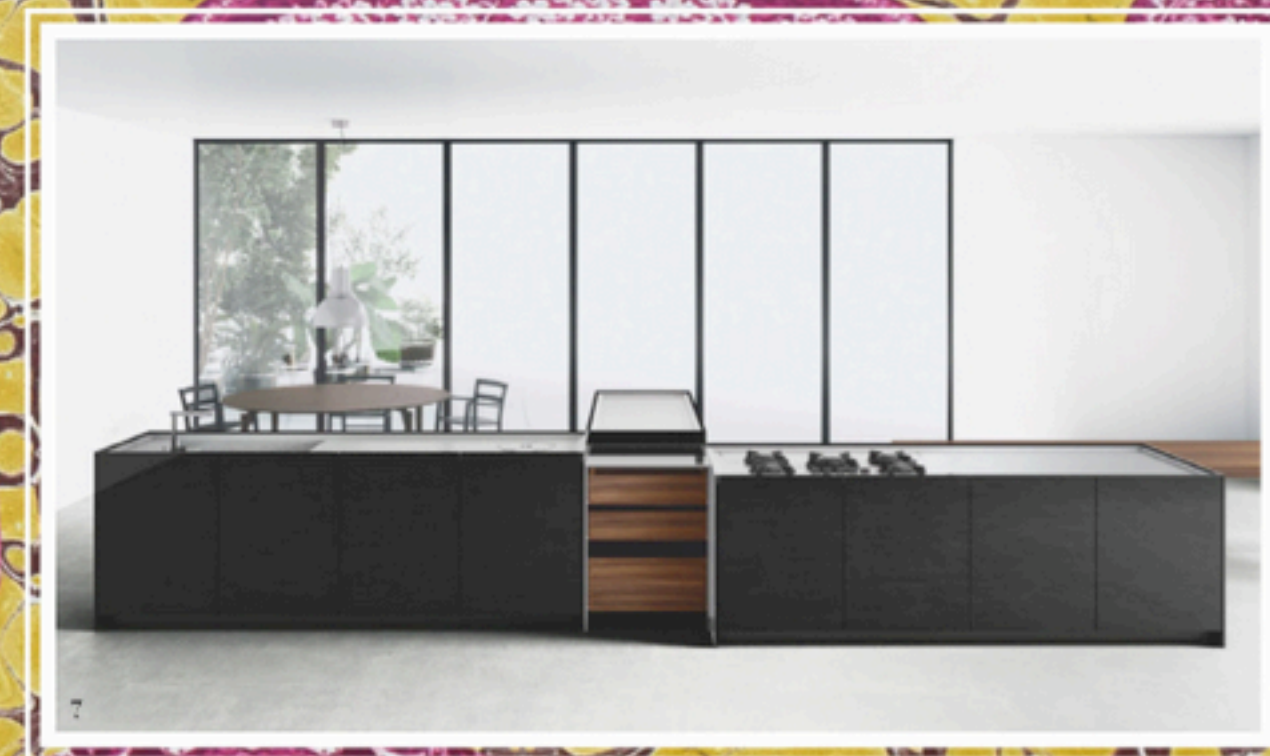
1 'Fold', £140,000, Steinger Designers 2 'Shape', from £36,000, Poliform 3 'C3', by Joshua Latner and Armando Pujatti, from £82,568 approx, Marrone & Mesubim 4 'Lignum et Lapis', by Antonio Citterio, £140,000 approx, Arclinea 5 'Utility Room', from £40,000, Smallbone 6 'SLX Pure', from £25,000, Siematic 7 'Combine', by Piero Lissoni, £125,580, Boffi. All prices include VAT. For suppliers' details see Address Book >