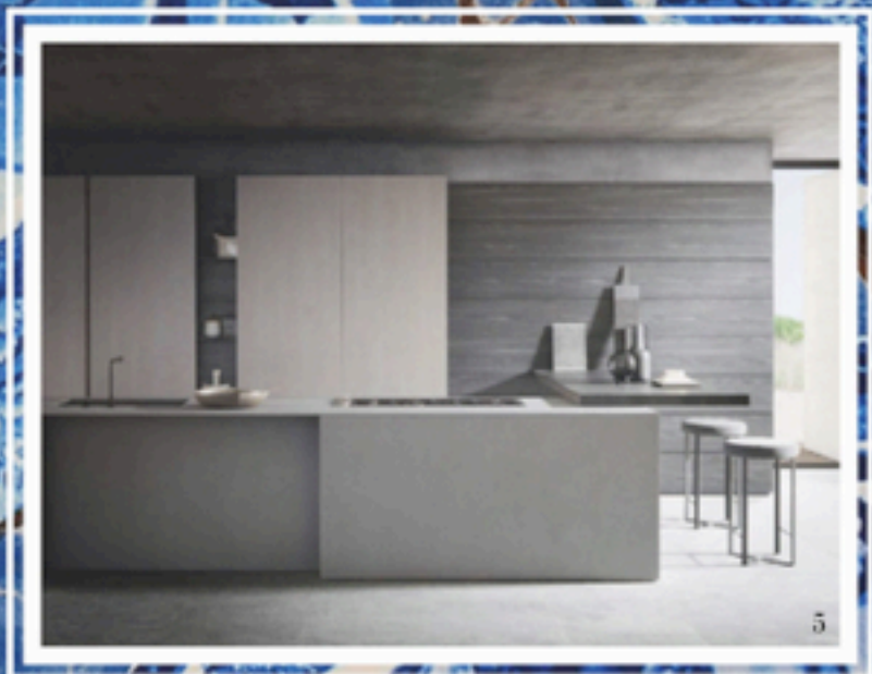
1 'B3' sideboard, £15,000, Bulthaup. 2 'Campden Hill Court', from £60,000, Espresso Design. 3 'Metallics' by Charlie Smallbone, from £50,000, Ledbury Studio. 4 'Henge Ozone L', by Massimo Castagna, £91,960, Global Luxury London. 5 'MH6', by Modulnova, from £25,000, by Designspace London. All prices include VAT. For suppliers' details see Address Book >