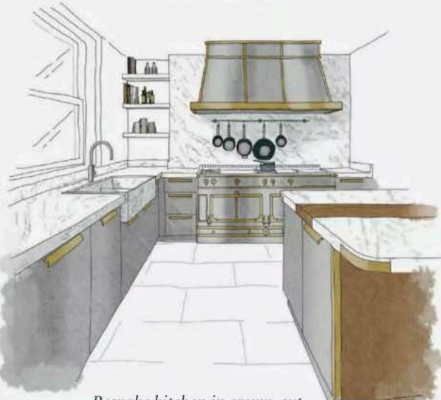
Bespoke kitchen in crown-cut oak and 'Invisible Green' paint by Little Greene, £90,000, Hetherington Newman