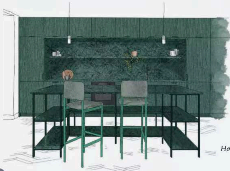
Bespoke kitchen, by Hølte × Emil Eve Architects, from £40,000, Hølte