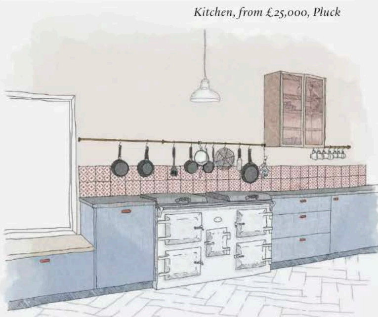
Kitchen, from £25,000, Pluck