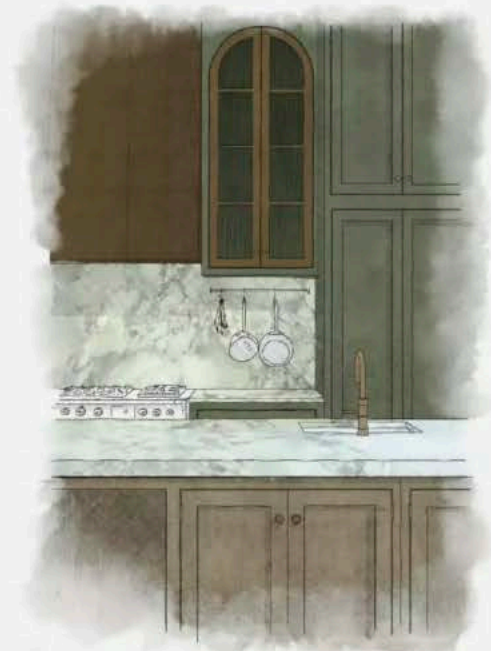
'Oxford', from £70,000, Ledbury Studio