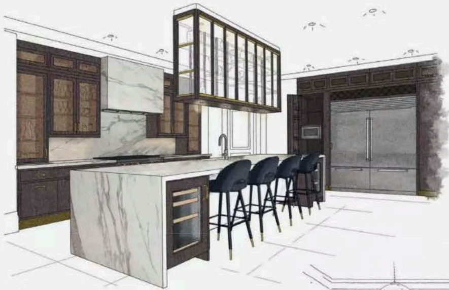
'Icarus', from £100,000, Smallbone