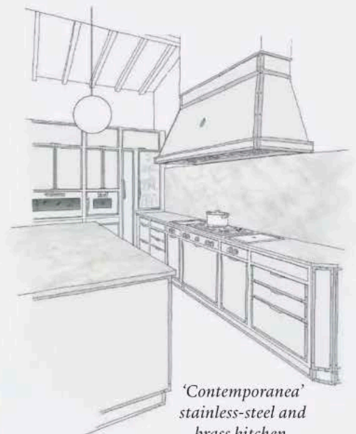
'Contemporanea' stainless-steel and brass kitchen, from £120,000, Officine Gullo